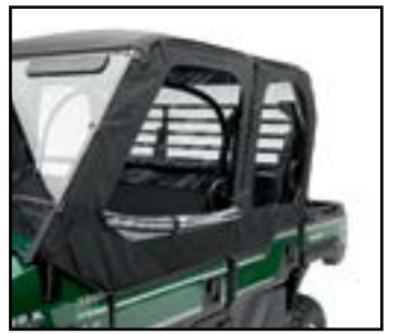
SOFT CABIN SYSTEM Modular system to protect the user from the elements. Consists of: top, doors, and polycarbonate windshield; all sold separately.