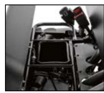
STORAGE BIN Make good use of the space under the passenger seat to fit this useful 13.6-litre storage bin. Seat bottom acts as a lid for the contents.