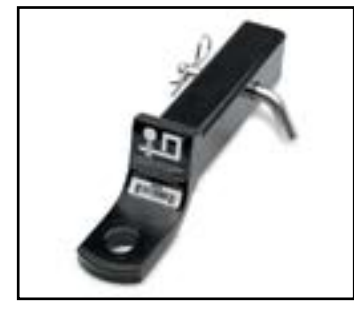
TOWBALL BRACKET For all your towing needs: this bracket facilitates attachment of most towball hitches.