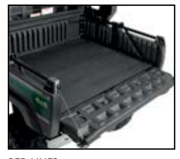
BED LINER Protect your loading bed from wear and damage with this durable bed liner.