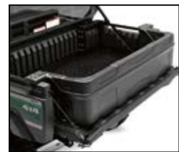
BED EXTENDER Maximise the usage of the load bed on your MULE by using the bed extender, the clamps allow you to adjust the length to your cargo.