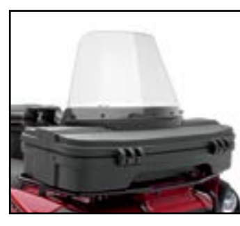
ATV WINDSHIELD Mounts to front cargo box. Durable 6mm hard-coated polycarbonate. Size: H 35cm, W 56cm. Windshield top 61cm above rack surface. Cargo box (ATV900001) required - not included.