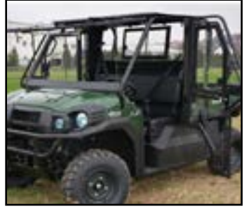
HARD CABIN FOR DX Structure made of high grade steel with quality black finish. Flip-up tinted single layer safety glass windscreen with rubber seals and locks. The doors are equipped with hydraulic stoppers, automotive style locks and sliding safety glass side windows