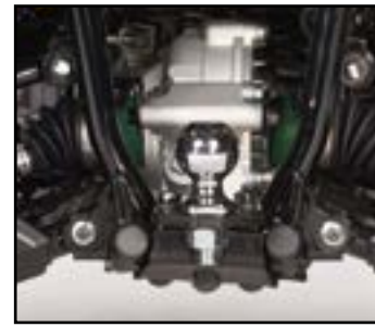
TOWBALL A towball is an essential accessory to many, and this one is E-approved for use in Europe.