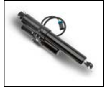
BED LIFT KIT Self-contained hydraulic system to effortlessly raise the full-rated load of the MULE load bed. Easy to install and operate.