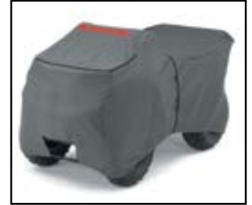
ATV COVER Protect your ATV with this water and mildewresistant cover featuring dual security straps and zippered fuel tank access, plus front and rear openings for tie-downs.