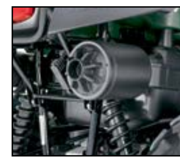
STORAGE CASE (CANISTER) Storage canister with screw-on lid that attaches to right rear of ATV.