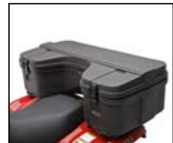
REAR CARGO BOX With a rubber-sealed lid to keep out dust and water plus two lockable latches. This sturdy polyethylene bodied box bolts firmly to the rack (L 101 x W 48 x H 30 cm).