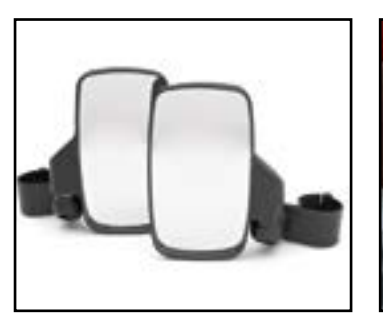
SIDE MIRRORS Fit these adjustable side mirrors for increased safety in the work zone and easier vision for manoeuvrability on site.