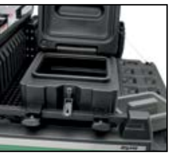
CARGO BOX Secure small items on your excursions with this versatile storage case. Features an insert for additional organisation. Can be locked for extra security.