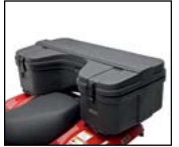
REAR CARGO BOX With a rubber-sealed lid to keep out dust and water plus two lockable latches. This sturdy polyethylene bodied box bolts firmly to the rack (L 101 x W 48 x H 30 cm).