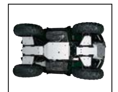
SKID PLATES These brushed aluminium skid plates help protect the ATV frame over rough terrain and get you safely over obstacles and attach to stock mounting points.