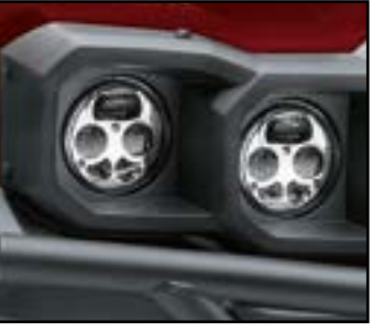
LED LAMPS Replace or supplement standard halogen lights with LED headlamps. These use less power to deliver a 50% brighter output with longer life.