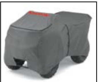
ATV COVER Protect your ATV with this water and mildewresistant cover featuring dual security straps and zippered fuel tank access, plus front and rear openings for tie-downs.