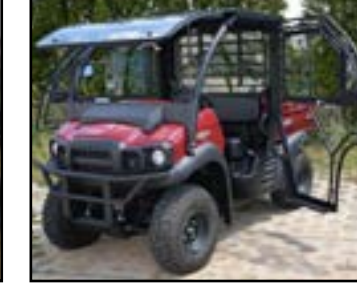
HARD CABIN FOR SX Structure made of high grade steel with quality black finish. Flip-up tinted single layer safety glass windscreen with rubber seals and locks. The doors are equipped with hydraulic stoppers, automotive style locks and sliding safety glass side windows. Available in packages and as modular parts.