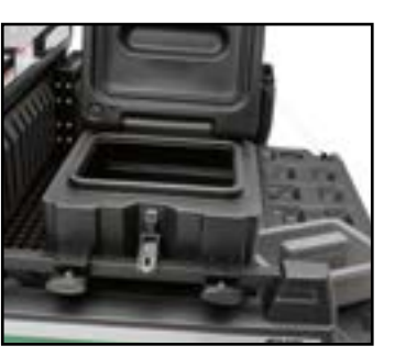
CARGO BOX Secure small items on your excursions with this versatile storage case. Features an insert for additional organisation. Can be locked for extra security.