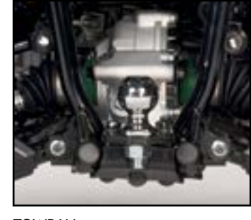
TOWBALL A towball is an essential accessory to many, and this one is E-approved for use in Europe. Ball = 5,0 cm diameter. Shaft = 2,4 cm, thread 2,0 cm diameter.