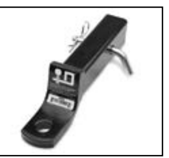
TOWBALL BRACKET For all your towing needs: this bracket facilitates attachment of most towball hitches.