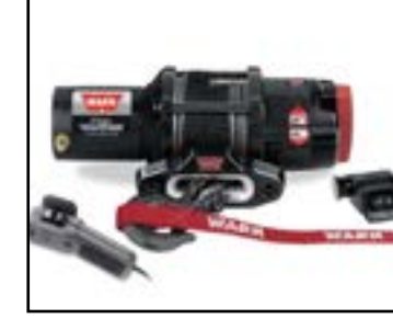
WARN® ProVantage™ winches a powerful permanent magnet motor, a smooth efficient three-stage planetary gear train, metal gear housing, an easy-to-use clutch control dial, fully sealed to keep the elements out, a patented roller disc brake for excellent control while winching, and a corrosion-resistant black powder-coated finish with a unique black hook and tie rods