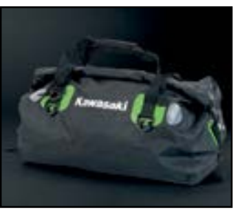
LUGGAGE ROLL 35 LITRE WATERPROOF Strong waterproof and UV-resistant Kawasaki luggage roll with shoulder strap, safety retro-reflective details and four attachment points. Size: 35 I (Ø30 cm, length 55cm).