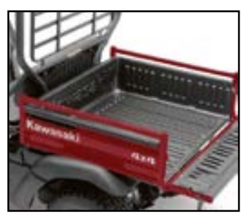
BED MAT Thick, tough rubber mat protects the load bed, reduces load slip and cuts down on noise. MULE logo imprinted on centre of hod mat